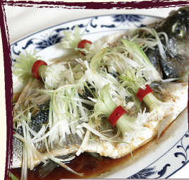
43 Steamed Sea Bass