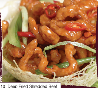
110 Deep Fried Shredded Beef with Chilli