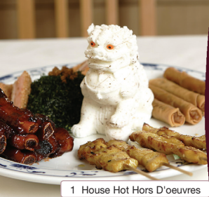
1 House Hot Hors D'oeuvres