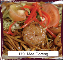
179 Mee Goreng