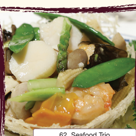
62 Seafood Trio