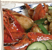
42 Fresh Lobster (in shell)