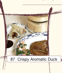
87 Crispy Aromatic Duck