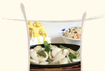
58 Scallops with Ginger & Spring Onions