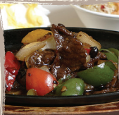
107 Beef with Green Peppers in Black Bean Sauce