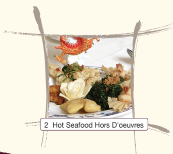
2 Hot Seafood Hors D'oeuvres