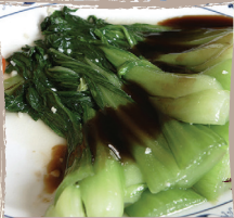
167 Stir-Fried Seasonal Chinese Vegetables