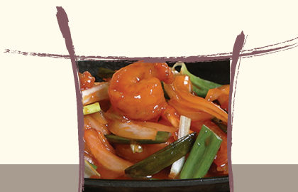
68 Prawns in Peking Sauce