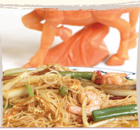
177 Singapore Rice Noodles