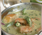
152 Green Thai Prawn Curry