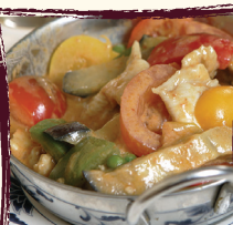
151 Thai Chicken Curry