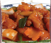
139 Sweet & Sour Chicken "Hong Kong Style"