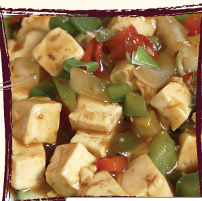
153 Ma Po Beancurd