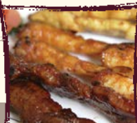
3 Grilled House Satay