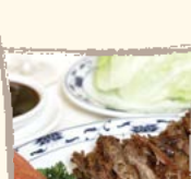
31 Mongolian Aromatic Lamb