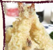
26 Tempura Prawns