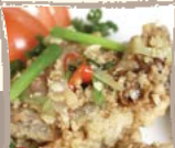
18 Soft Shell Crab