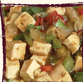
153 Ma Po Beancurd