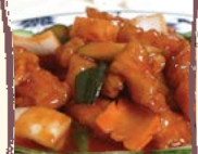
139 Sweet & Sour Chicken "Hong Kong Style"