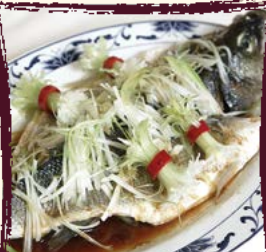
43 Steamed Sea Bass