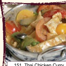
151 Thai Chicken Curry