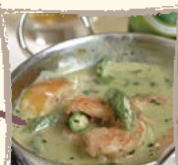
152 Green Thai Prawn Curry