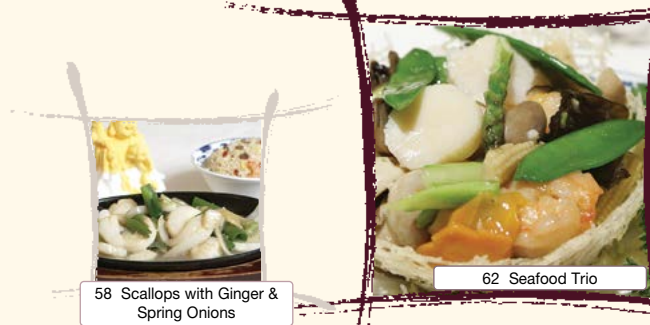
58 Scallops with Ginger & Spring Onions