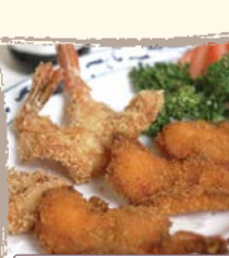
22 "Butterfly" Prawns