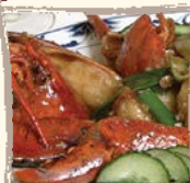
42 Fresh Lobster (in shell)