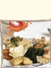
2 Hot Seafood Hors