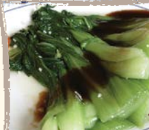
167 Stir-Fried Seasonal Chinese Vegetables