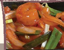
68 Prawns in Peking Sauce