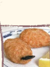
19 Stuffed Crab Claw