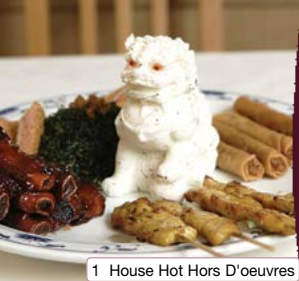
1 House Hot Hors D'oeuvres